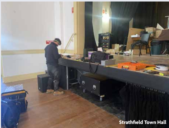
Strathfield Town Hall