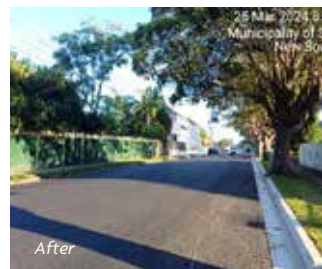
Dickson Street, Strathfield (Hyderbrae St to Merley Rd) Kerb and Gutter