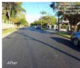
Llandilo Avenue, Strathfield (Tiptree Av to Cotswold Rd)