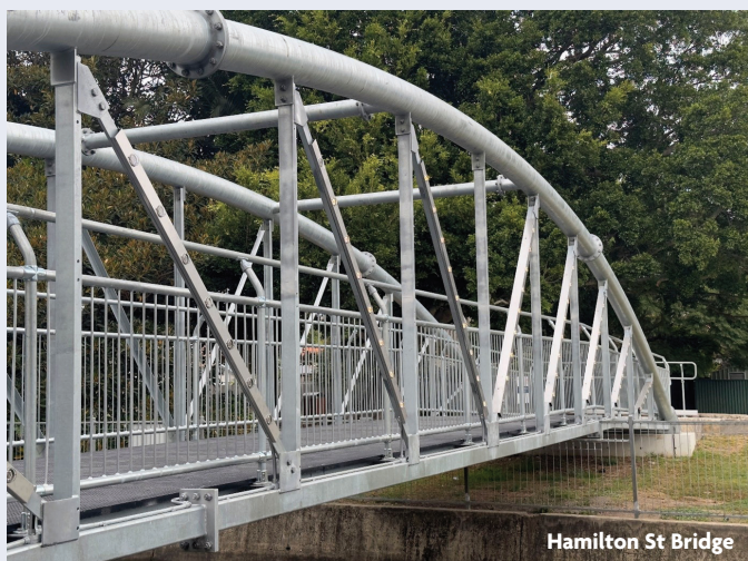
Hamilton St Bridge