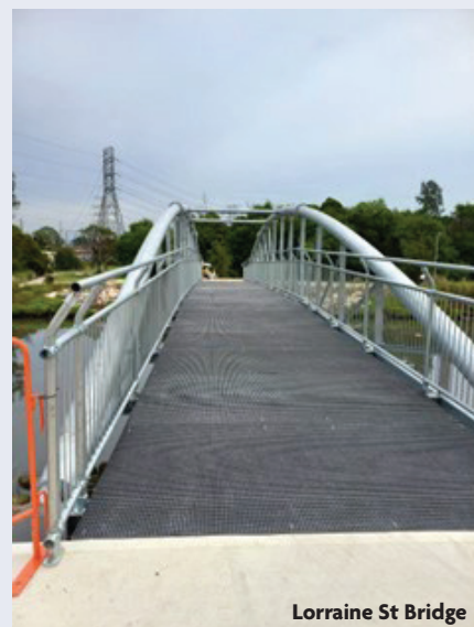
Lorraine St Bridge

The installation of lighting on the Lorraine Street bridge is scheduled to be completed in August. The artwork on this bridge focuses on Strathfield's diversity and inclusive community, highlighting diversity in all its forms.