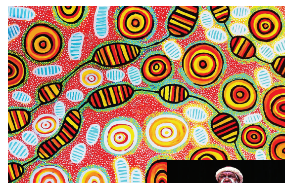
Water Dreaming Rock Holes, 2020, acrylic on canvas.