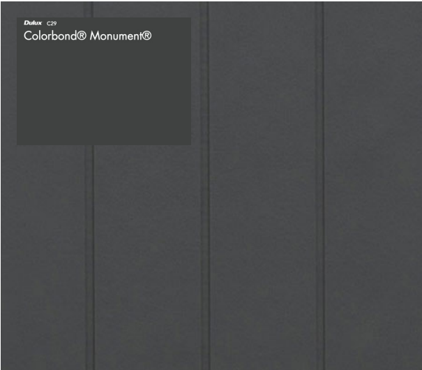
FC Cladding Boral Scyon Axon Smooth 133 Dulux Colorbond - Monument