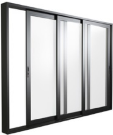
Doors & Windows - Aluminium / Steel Powder Coat - Black