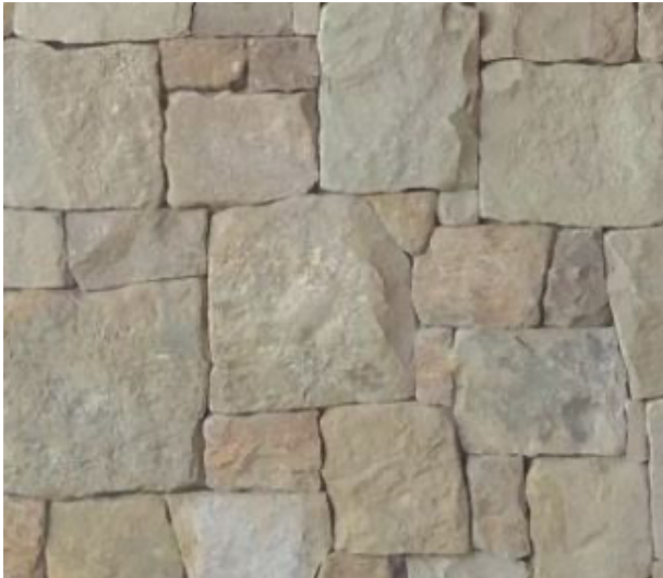
Front Fence walls Sandstone Clad