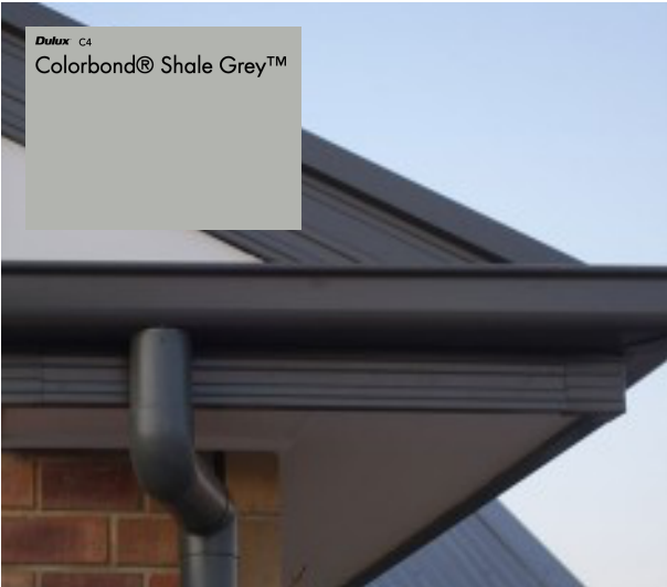
Fascia, Gutters & Down Pipes - Steel Dulux Colorbond - Shale Grey