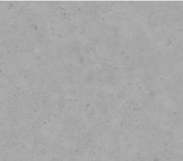
Front Balcony Off Form Concrete Finish