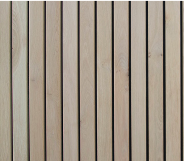
Timber Board Cladding. Shiplap Profile Mounted