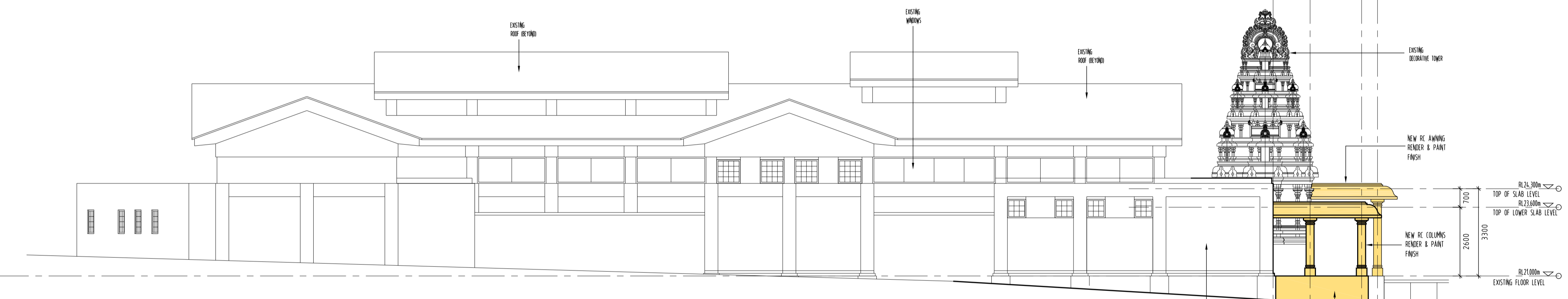
EAST ELEVATION SCALE 1/100 (A1)

STRATHFIELD COUNCIL RECEIVED DA2020/227 10 December 2020