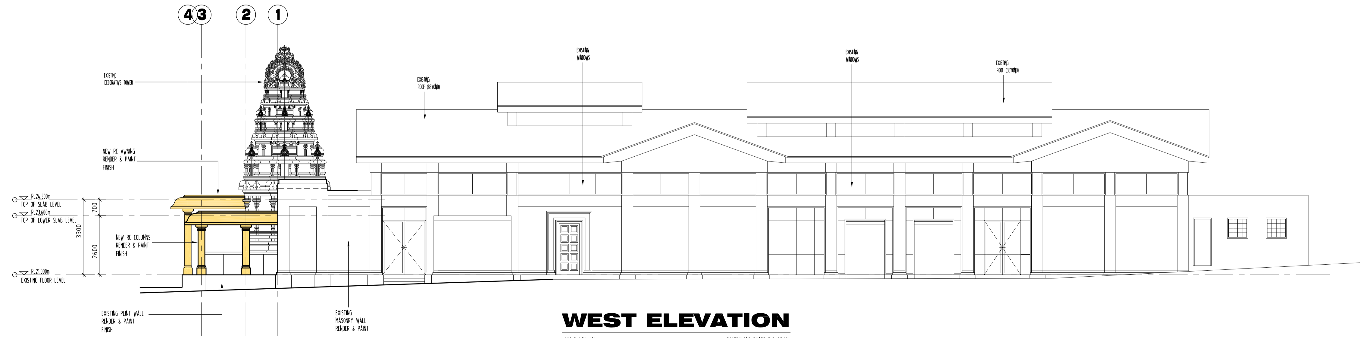
WEST ELEVATION SCALE 1/100 (A1) (EASTBOURNE ROAD ELEVATION)

PROPOSED AWNING AT THE FRONT MAIN ENTRY TO AN EXISTING HINDU TEMPLE AT 123 THE CRESCENT, HOMEBUSH WEST, NSW 2140. FOR 'SYDNEY SRI KARPAGA VINAYAKAR TEMPLE'