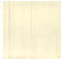
Bone White W B27