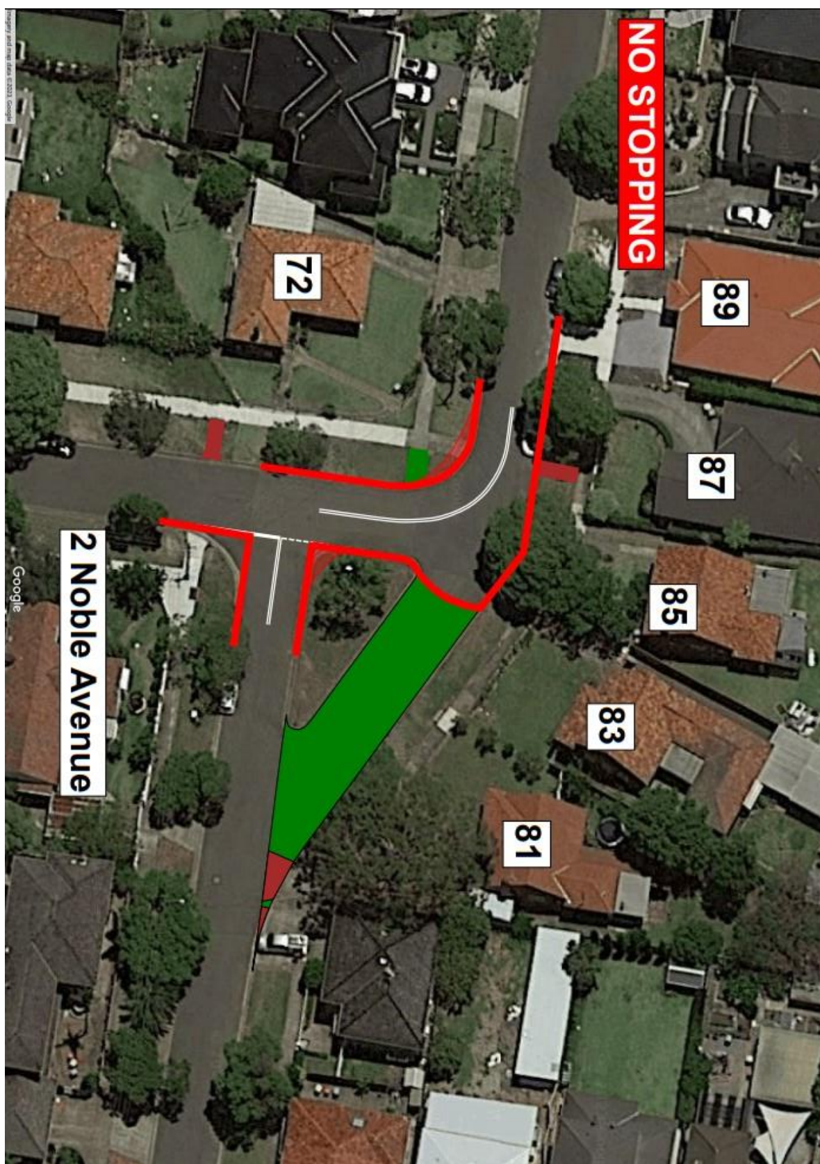
Figure 2 – proposed parking restrictions to support full road closure of Mintaro Avenue