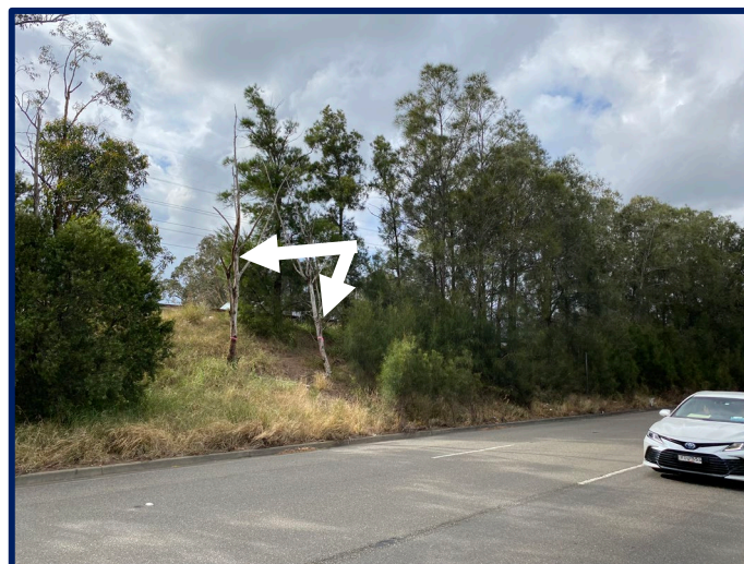
Example of dead trees on Marlborough Road northbound

Our work needs to be carried out at night to limit disruption to traffic and reduce safety risks to our workers, pedestrians and road users. It may be noisy at times, but we will do everything we can to minimise noise impacts, including turning off equipment and vehicles when they are not in use and using quieter equipment such as electric chainsaws (compared to petrol powered). The vast majority of dead trees being removed are small in diameter so their removal will only have short-term noise impacts. Tree removal work will be carried out over two to three shifts.