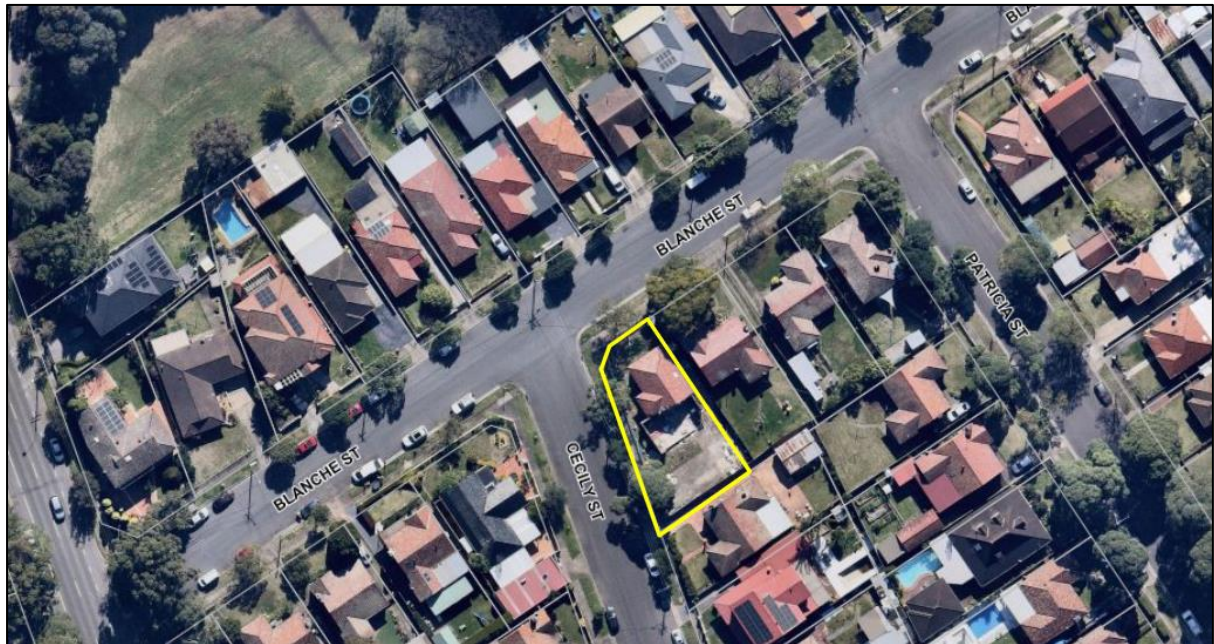
Figure 1: Locality plan (subject site outlined in yellow) with surrounding residential development.