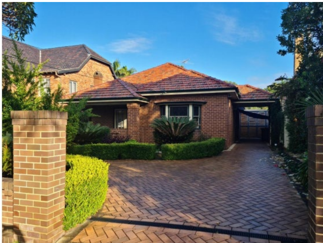
Figure 3: Front façade of existing dwelling