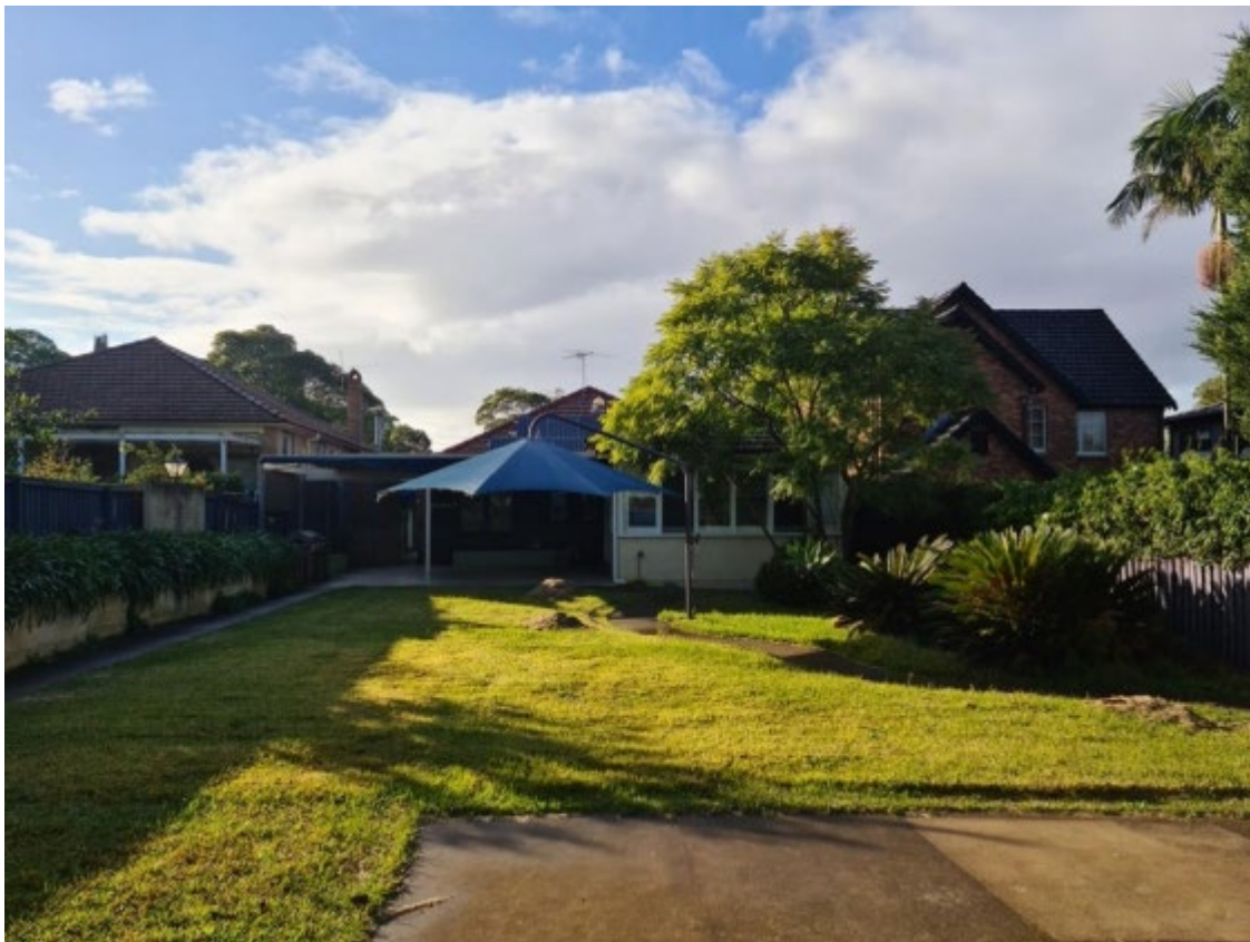
Figure 4: Rear backyard facing towards existing dwelling