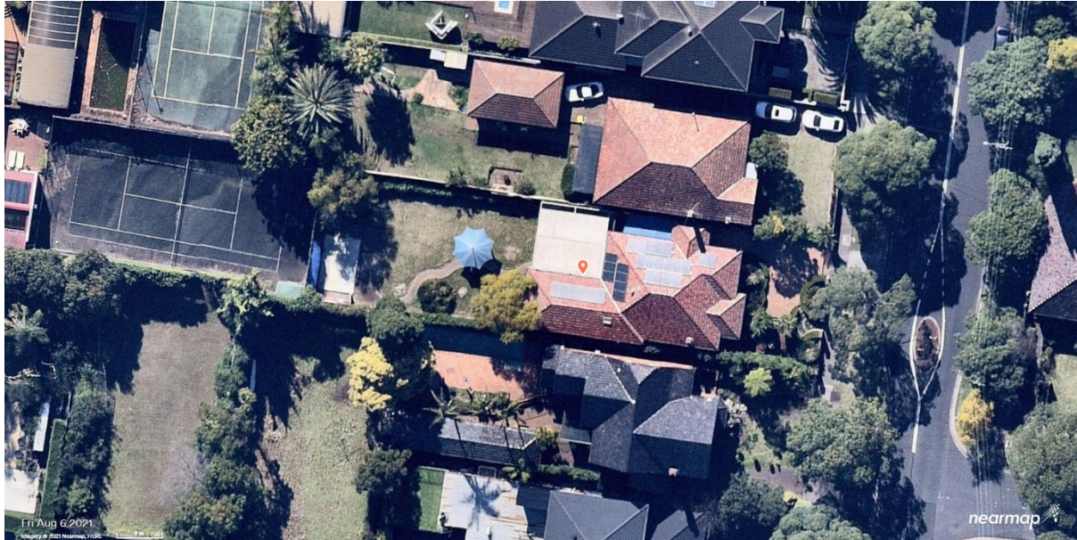
Figure 2: Closer aerial image of the site

The current streetscape is characterised by a range of one (1) to two (2) storey dwelling houses with a range of architectural styles. The surrounding area is characterised by low density residential, Chalmers Road School is located 140m north of the development. Strathfield Park is 200m south of the proposed development on the eastern side of Chalmers Road.