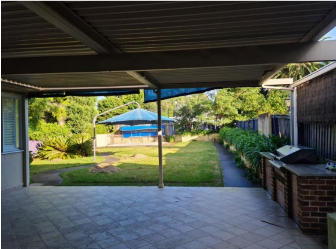
Figure 3: Rear backyard facing west