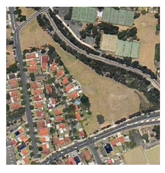
Elliott Reserve aerial map 2009