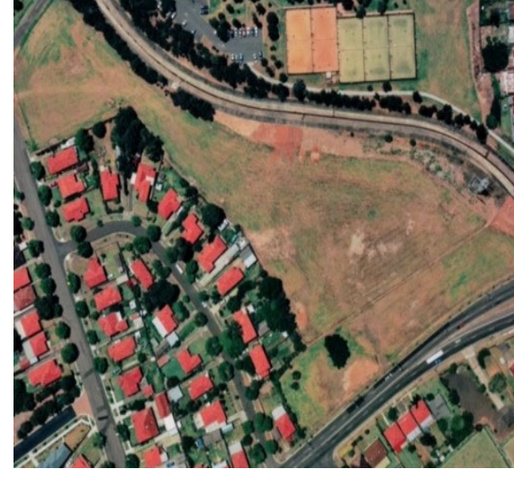
Elliott Reserve aerial photograph (1997)