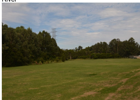
Cluster of trees near Punchbowl Road & Cooks River