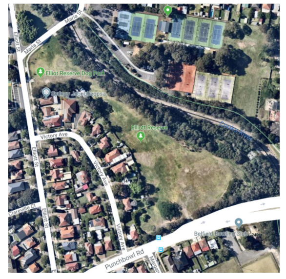
Elliott Reserve aerial map 2019.