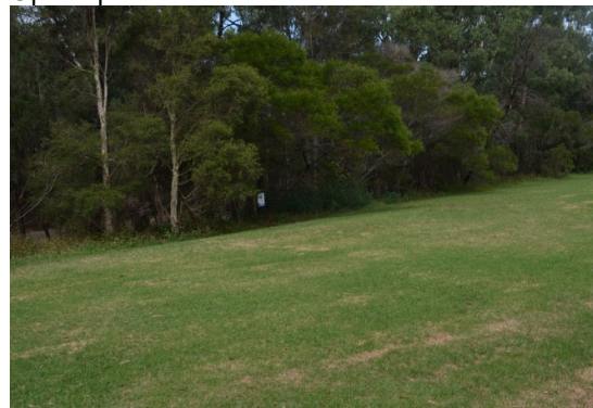
Cluster of trees near Maria Street & Cooks River