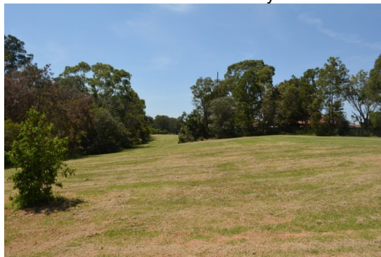
Open space – Elliott Street