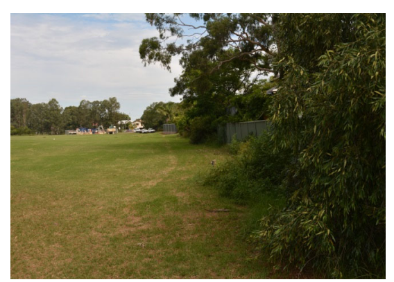
Open space, fence line near Victory Ave