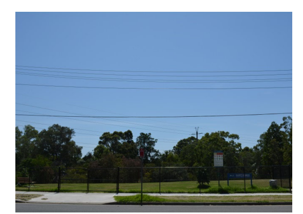
Elliott Reserve – Elliott Street entry