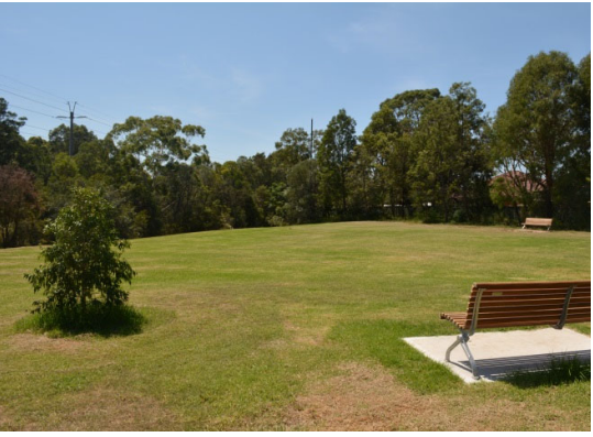
Open space – Elliott Street