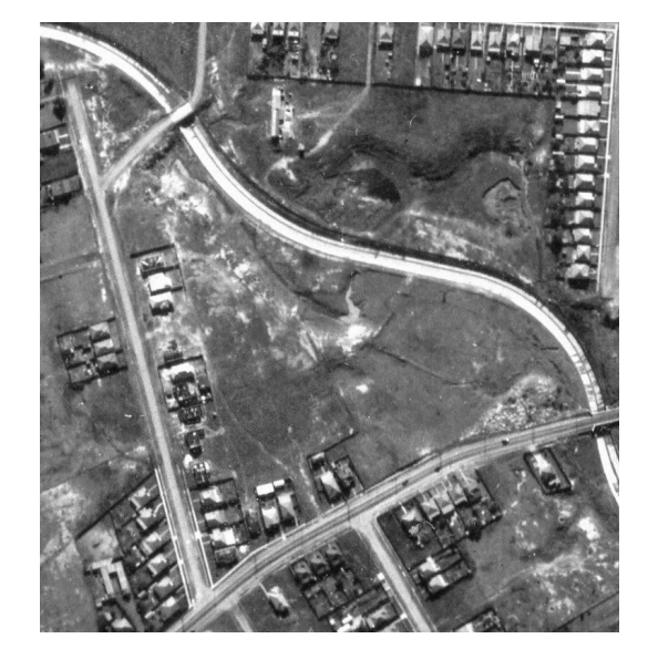
Elliott Reserve aerial photograph (1947)

The aerial historic photographs indicate changes in the park over time, particularly revegetation of the park, especially near the canal and boundaries of the park.