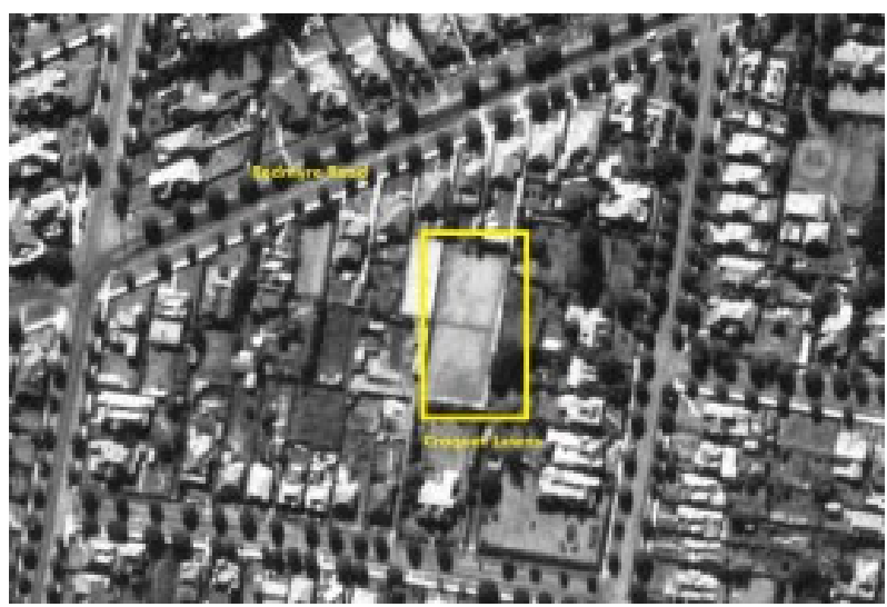
Strathfield Croquet Lawns aerial photograph (1947)

Figure 2 Historical photograph of Croquet Lawns