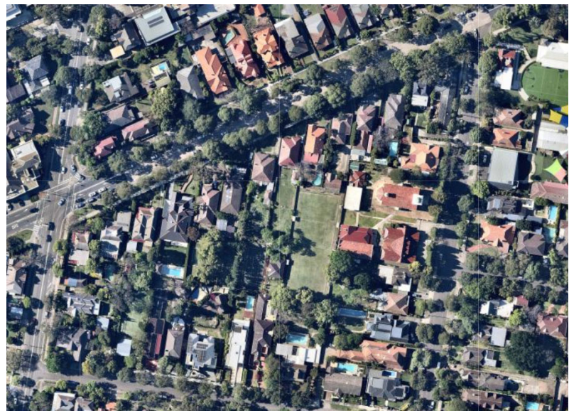
Strathfield Croquet Lawns aerial photograph (2019)