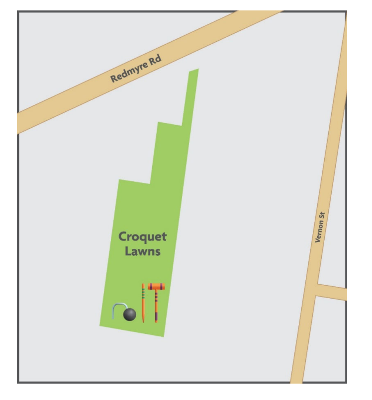
Figure 1 Croquet Lawns at 50 Redmyre Road Strathfield Location Map