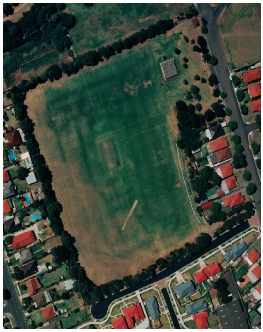
Bark Huts Reserve aerial photograph (1997)