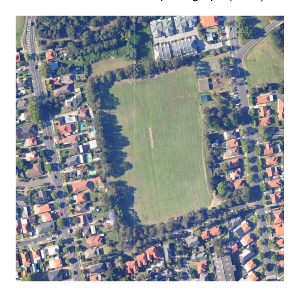
Bark Huts Reserve aerial photograph (2009).