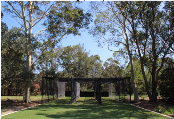
Three lane cricket practice wickets (2020)