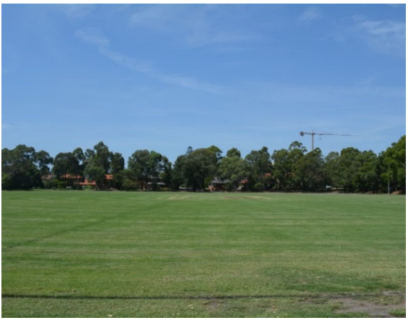
Bark Huts Reserve sportsfield (2019)