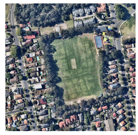
Bark Huts Reserve aerial photograph (2019).