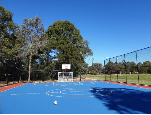
Multipurpose Court (2019)