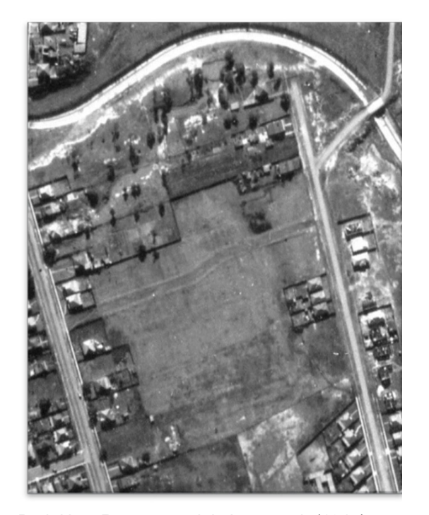
Bark Huts Reserve aerial photograph (1947)

These historic photographs indicate the development of the reserve since the 1940s with additions of sportsfields, amenities, playgrounds and tree plantings.