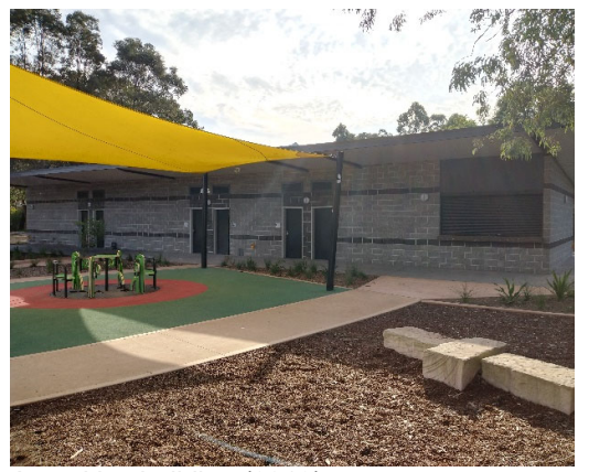
Amenities building (2019)