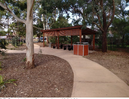
BBQ, shelter & seating (2019)