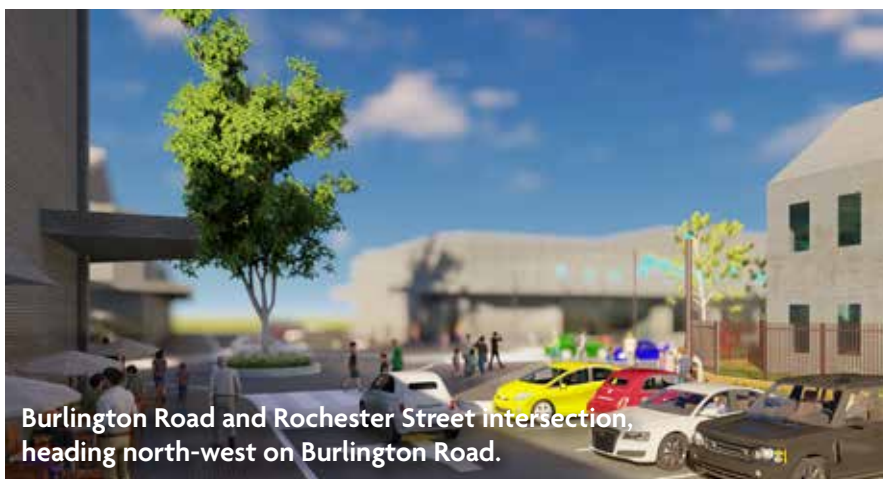
Burlington Road and Rochester Street intersection, heading north-west on Burlington Road.