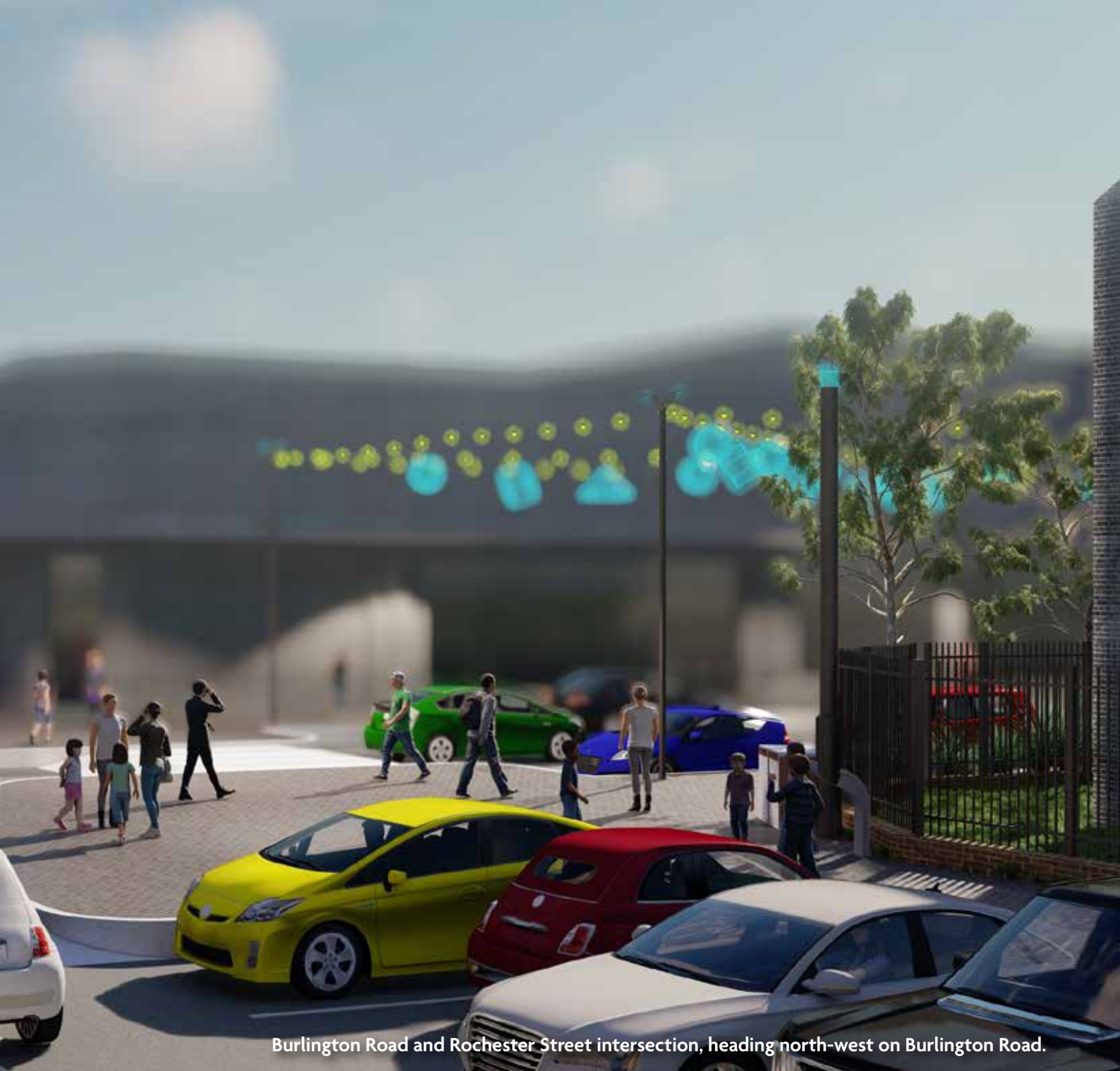
Burlington Road and Rochester Street intersection, heading north-west on Burlington Road.