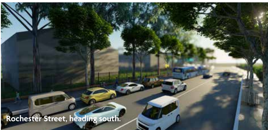
Rochester Street, heading south.