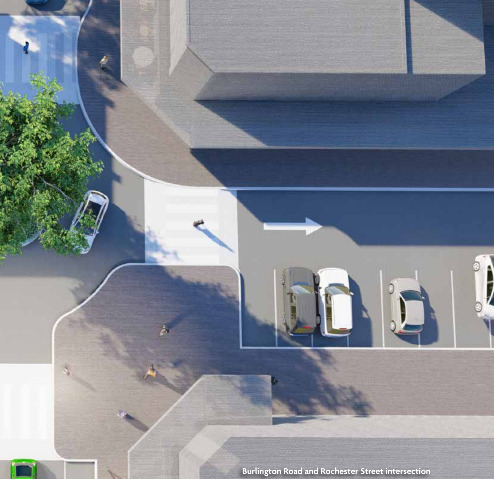
Burlington Road and Rochester Street intersection