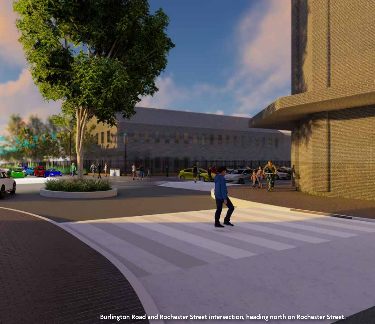
Burlington Road and Rochester Street intersection, heading north on Rochester Street.